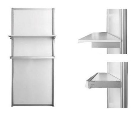
STRAIGHT SHELF 35,00€/UNIT