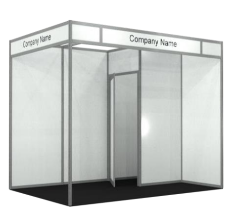
STORAGE ROOM 1m x 1m - 120€ 1m x 2m - 150€ 1m x 3m - 170€