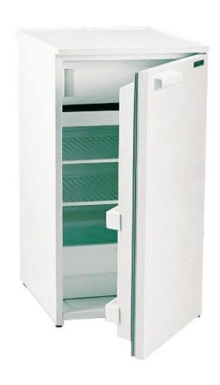
WHITE SMALL FRIDGE