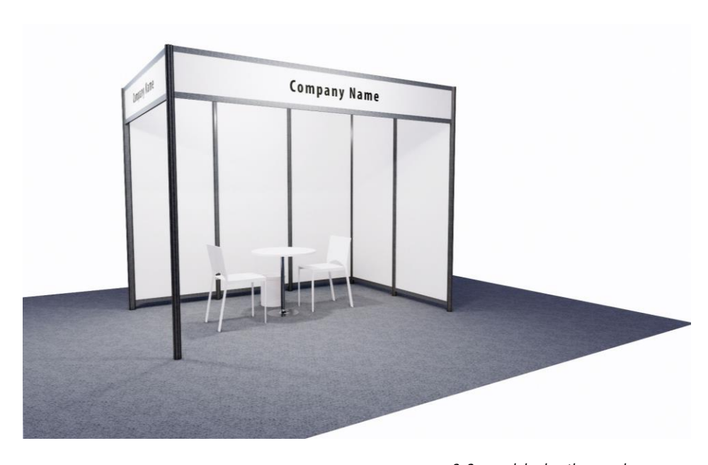
3x2m modular booth example