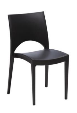
LISA Colour: Black 20,00€