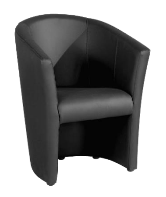
UMBRIA II Colour: Black 95,00