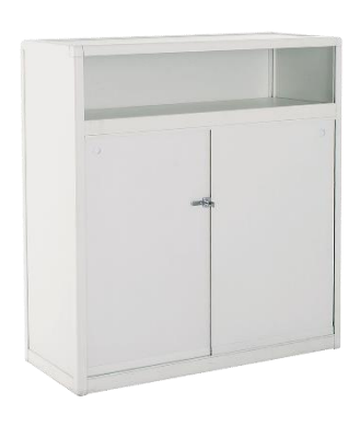
COUNTER WITH DOORS WHITE OR BLACK - 149,00€