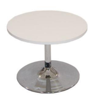
TABLE BASSE Colour: Glass H: 50cm 45,00€