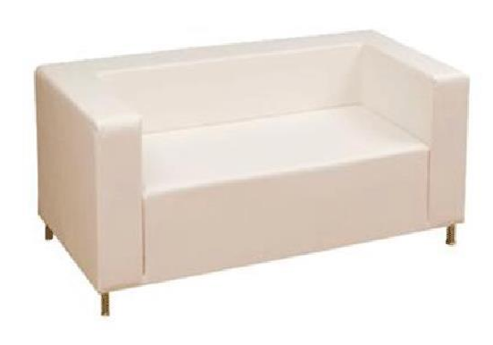
WHITE SOFA 2 PERS Colour: White 310,00€