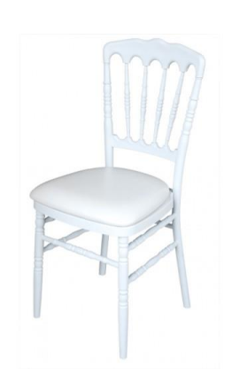
NAPOLEON Colour: White 20,00€