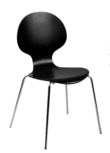
OPUS Colour: Black 45,00€