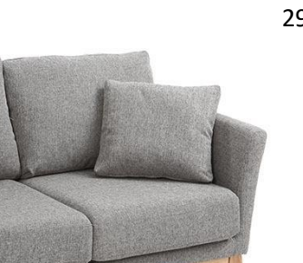
CANAP SCANDI Colour: GREY 290,00€