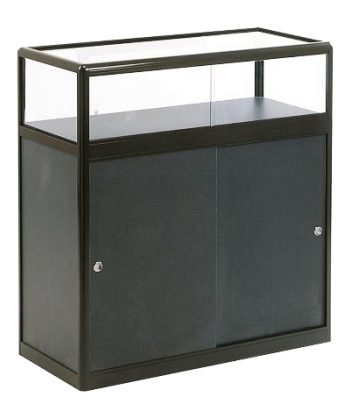
MODULAR SHOWCASE COUNTER WHITE OR BLACK - 298,00€