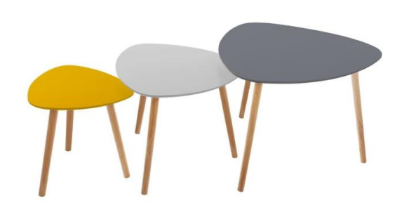
GIGOGNE Colour: YELLOW WHITE & GREY 69,00€