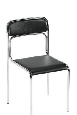
VINYL Colour: Black 20,00€