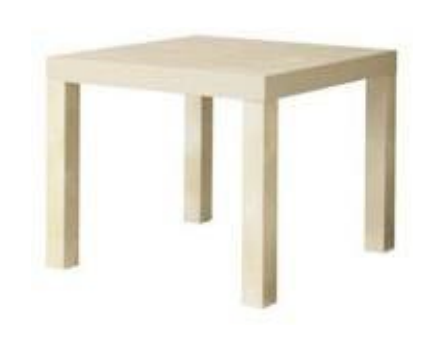
LACK Colour: White/Black 15,00€