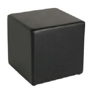
Colour: Black/White/Red 55,00€