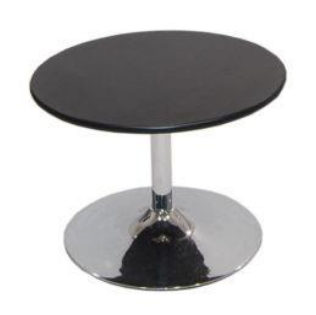
TABLE BASSE Colour: Black H 50cm 45,00€