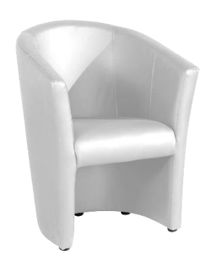
UMBRIAI Colour: White 95,00€