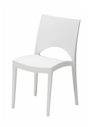
LISA Colour: White 20,00€