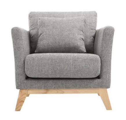
FAUT SCANDI Colour: GREY 145,00€