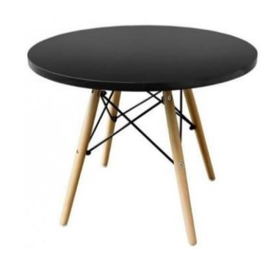
TOWER C Colour: Black/White H: 50cm 95,50€