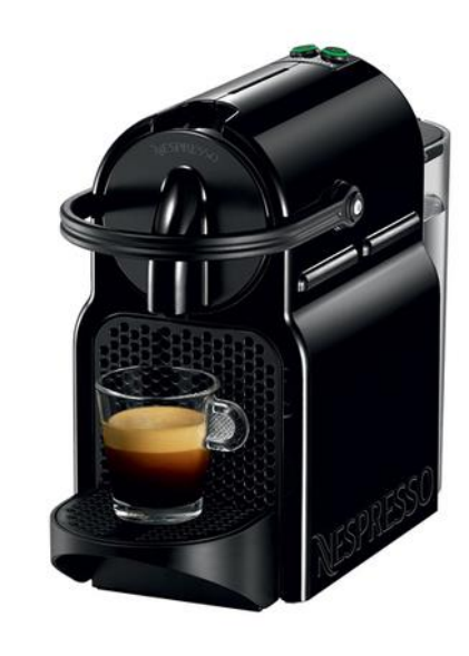
COFFEE MACHINE NESPRESSO With 100 kits 150,00€