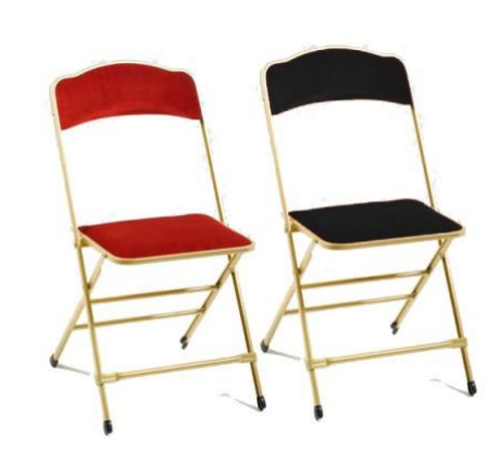
VELOURS Red or Black 20,00 Unit