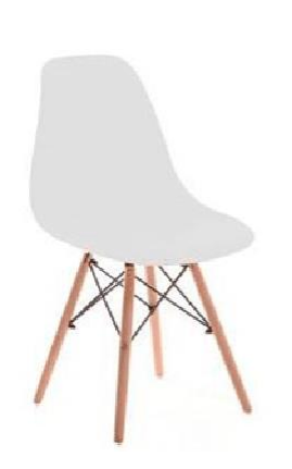
MOEMA Colour: White 52,50€