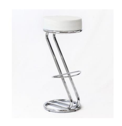
ZETA Colour: Black/White 35,00€