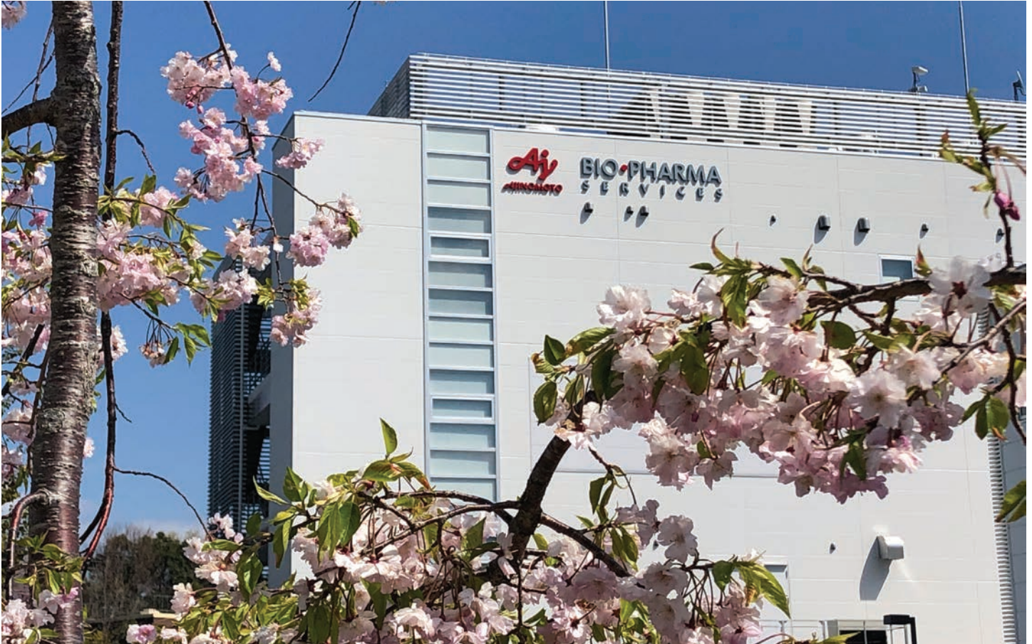
Ajinomoto Bio-Pharma Services Oligonucleotide API Manufacturing Center at the Osaka, Japan campus.

beginning to end. By selecting a CDMO that possesses extensive oligonucleotide experience, a structure that meets your stage of production, and the range of service capabilities to meet your needs, you will find yourself more prepared to seamlessly move your oligonucleotide-based drug therapeutic out of the lab and into the hands of patients, who need it most.