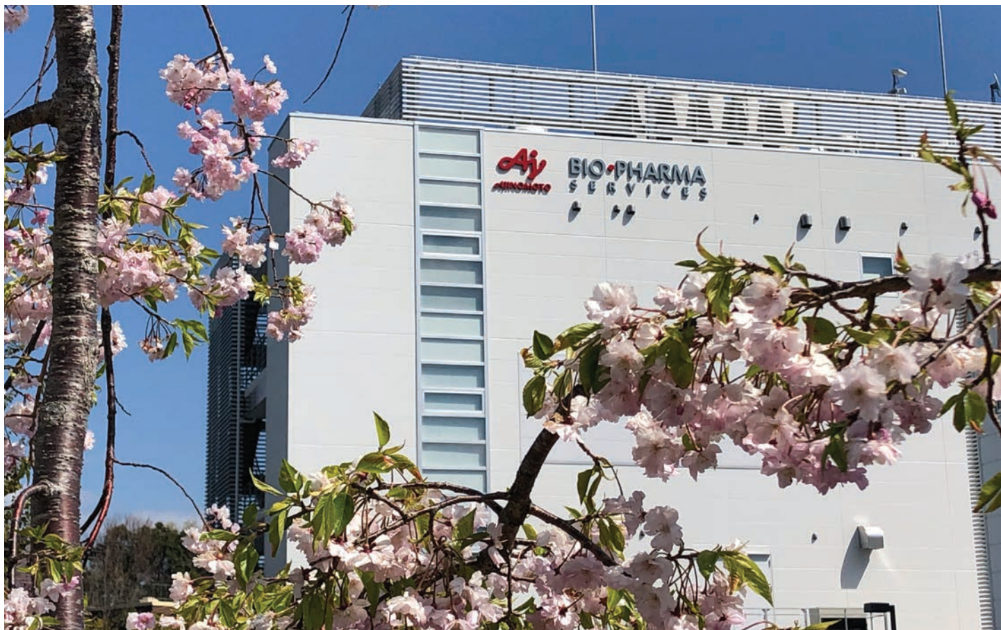
Ajinomoto Bio-Pharma Services Oligonucleotide API Manufacturing Center at the Osaka, Japan campus.

beginning to end. By selecting a CDMO that possesses extensive oligonucleotide experience, a structure that meets your stage of production, and the range of service capabilities to meet your needs, you will find yourself more prepared to seamlessly move your oligonucleotide-based drug therapeutic out of the lab and into the hands of patients, who need it most.